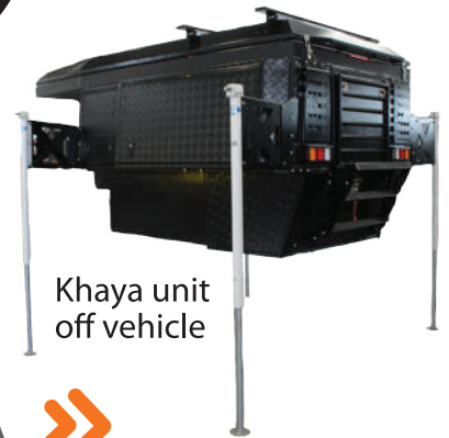
Khaya unit off vehicle