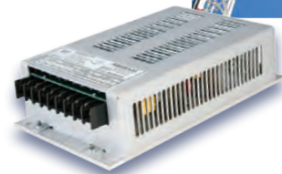
ABSOPULSE rugged power conversion solutions operate in an extensive range of telecommunications installations.