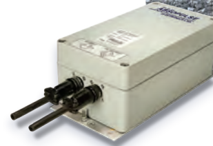
Our heavy-duty power conversion products have an excellent track record in mining, dredging and earth moving equipment.