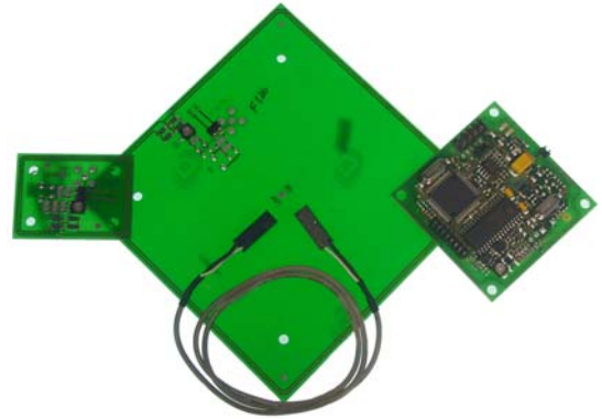
As external antennas, two 50Ω antennas ID ISC.ANT40/30 and ID ISC.ANT100/100 are available.

FEIG ELECTRONIC reserves the right to change specification without notice at any time. Stand of information: August 2011.