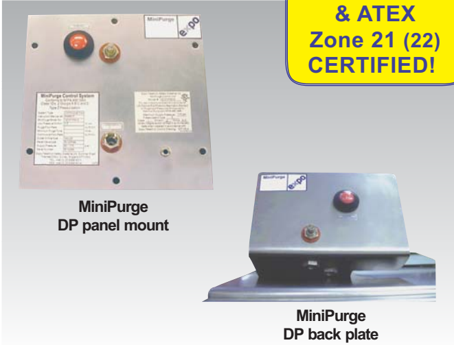
MiniPurge DP panel mount